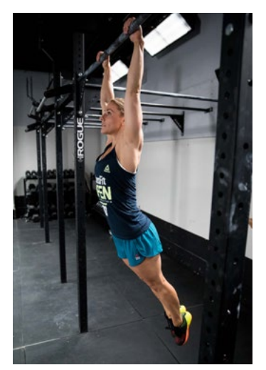
This is a standard chin-over-bar At the top, the chin must break the pull-up. Dead hang, kipping or horizontal plane of the bar. butterfly pull-ups are allowed as long as all the requirements are met. The arms must be fully extended at the bottom, with the feet off the ground.

CHIN-OVER-BAR PULL-UP (TEENAGERS AND MASTERS ONLY)