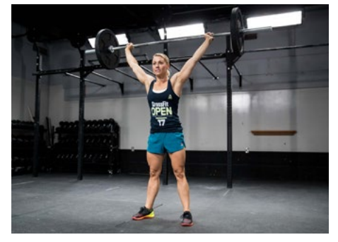
The barbell must come to full lockout overhead, with the hips, knees and arms fully extended, and the bar directly over or slightly behind the middle of the body. This is not a ground-tooverhead any way.

Scaled divisions and some masters divisions are not required to catch the bar below parallel and will be permitted to power snatch, pause or stand, and then proceed to the bottom of the overhead squat.