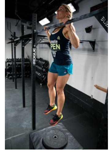
For jumping pull-ups, the bar should At the bottom, the arms must be At the top, the chin must break the be set up so it is at least 6 inches above the top of the athlete's head when standing tall.