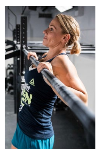
pull-up. Dead hang, kipping or come into contact with the bar butterfly pull-ups are allowed below the collarbone. as long as all the requirements are met. The arms must be fully extended at the bottom, with the feet off the ground.