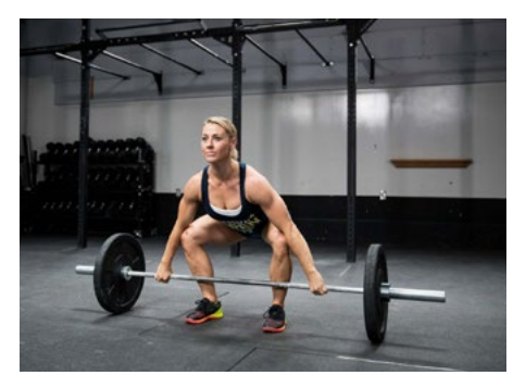
The barbell begins on the ground and must be lifted overhead in one motion. Touch-and-go is permitted. No bouncing or dropping and catching the barbell on the rebound. Once dropped, the barbell must settle on the ground before the athlete begins the next repetition.