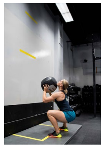
ball must be taken from the bottom target at or above the specified of a squat, hip crease below target height. If the ball hits low the knee, and thrown to hit the or does not hit the wall, it is a "no specified target.

In the wall-ball shot, the medicine The center of the ball must hit the rep." If the ball drops to the ground from the top, it cannot be caught off the bounce to begin the next rep. The ball must settle on the ground before being picked up for the next rep.