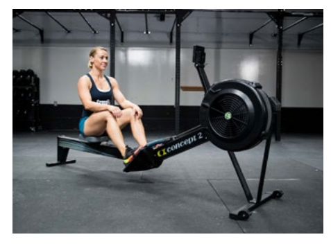
The monitor on the rower must be set to zero at the beginning of each row. The athlete or the judge may reset the monitor. The athlete must stay seated on the rower until the monitor reads 55 calories.