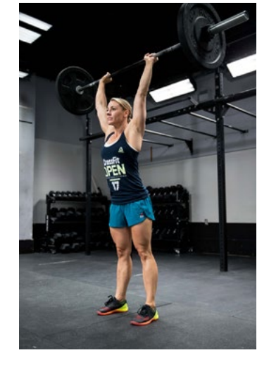
At the top, the arms, hips and knees are fully extended, and the bar finishes directly over the middle of the body with the feet in line under the body. Using a rack is not permitted.