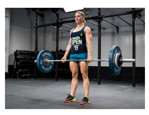
Starting at the floor, the barbell is lifted until hips and knees reach full extension with the head and shoulders behind the bar. The arms must be straight throughout. No bouncing.