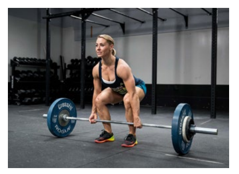
This is a traditional deadlift with the hands outside the knees. Sumo deadlifts are not allowed.