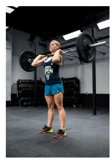
Each rep of the push press begins with the barbell at the shoulders and finishes with the weight fully locked out overhead and over the middle of the body. The athlete may dip and drive with the legs while the weight is on the shoulders. However, once the barbell leaves the shoulder, the hips and knees must remain straight until the weight is locked out overhead. No jerks.