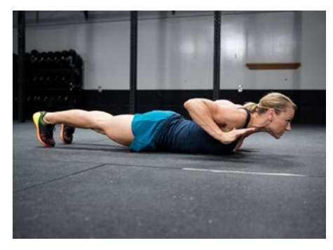
At the bottom, the chest (nipple line or above) must touch the floor, and the hands must be lifted completely off the ground.