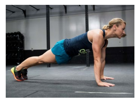
A straight body position must be maintained throughout the push-up. No snaking, sagging or pushing up from the knees is allowed. The elbows must be locked out at the top with the feet no wider than shoulder width.